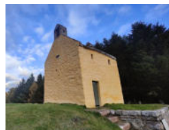
Ardclach Bell Tower